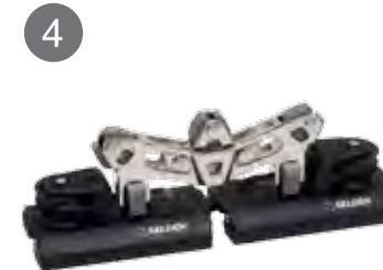
4 Triple main car