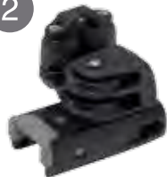
End control, Port