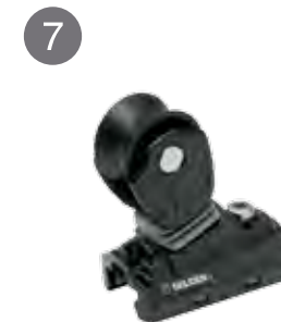
7 Sheet lead