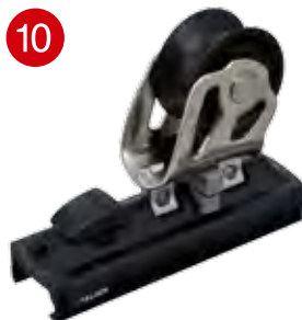
10 Genoa car high load, pinstop