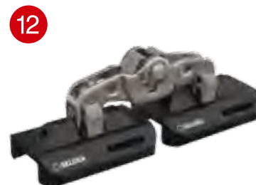
12 Double self tacking jib car