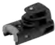
End control, single sheave