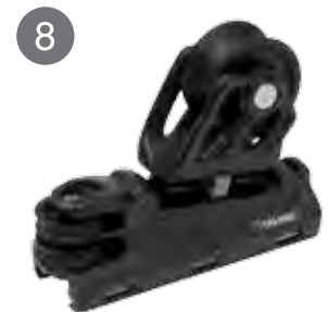
8 Genoa car high load