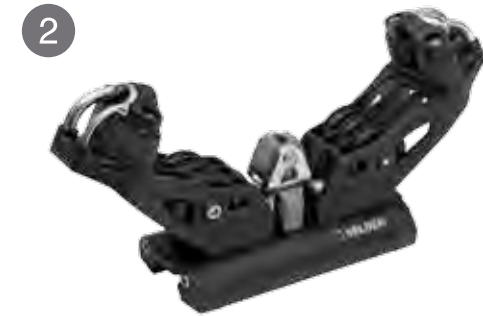
2 Main car with cam