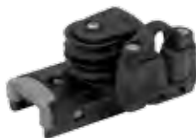
End control, Starboard