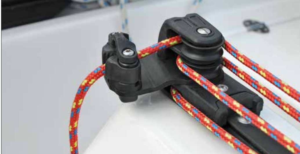
End control with cam cleat