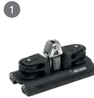
1 Main car