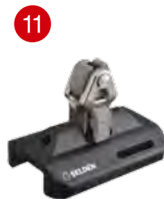
11 Self tacking jib car