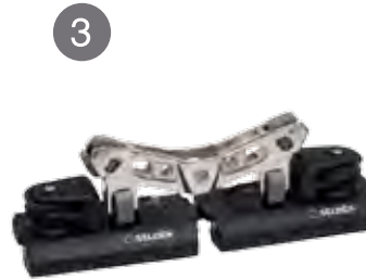
3 Double main car