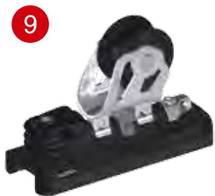
9 Genoa car ball bearing