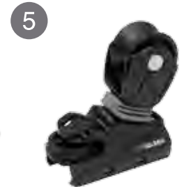
5 Genoa car