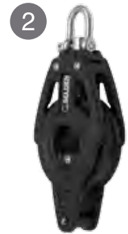
2 Single becket