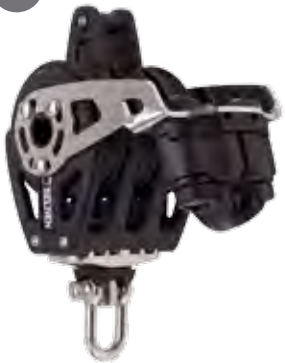
Triple becket cam