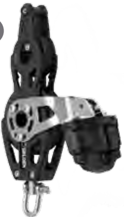
Fiddle becket cam