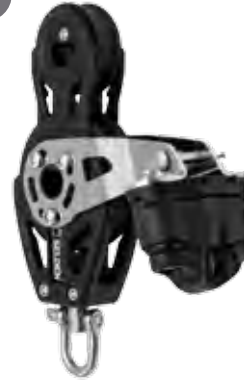
Fiddle cam with becket for fine tuning