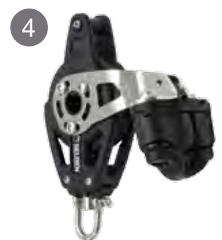
4 Single becket cam