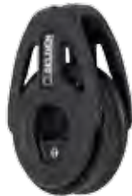
Single tie on