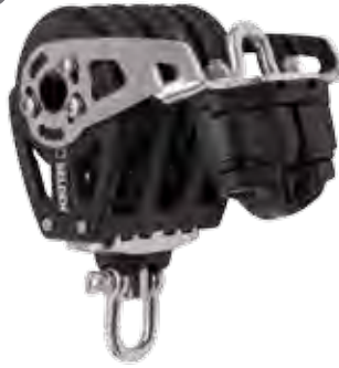
Triple cam with becket for fine tuning