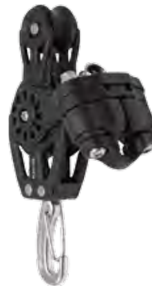
Fiddle hook cam eye