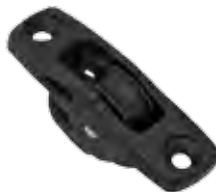
Single through deck