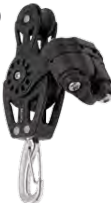
Fiddle hook cam