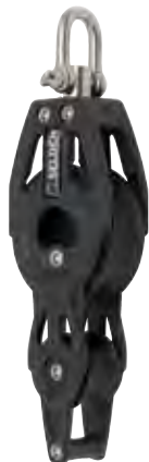
Fiddle swivel/fixed, bucket