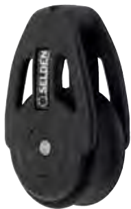
Single tie on