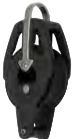
Single bucket strap (The strap can be removed)