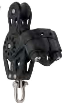
Fiddle swivel/fixed cam