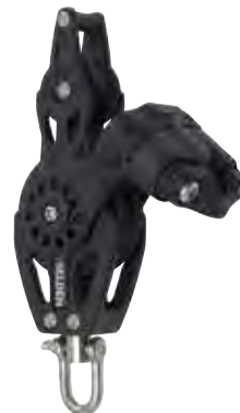
Fiddle swivel/fixed bucket cam