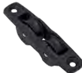
Double through deck