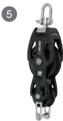
5 Fiddle becket

For more information about dimensioning, see page 94.