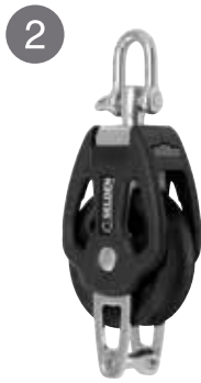
2 Single becket