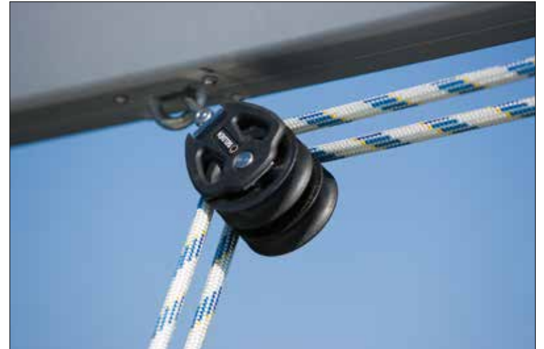
PBB 70 double.