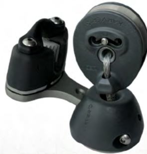
Swivel cleat bases for ratchet block