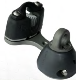
Swivel cleat bases with eye