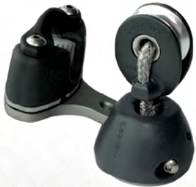
Swivel cleat bases for KB or KBO block

Assembled with KJ cam cleat, the compact and weight optimized KSC swivel cleat base is available in several models.